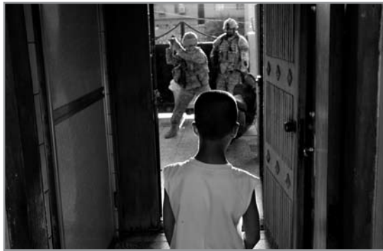
LEFT: July 11, 2007 Baghdad, Iraq