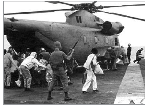
RIGHT: April 1975 Vietnamese refugee evacuation mission off coast of South Vietnam