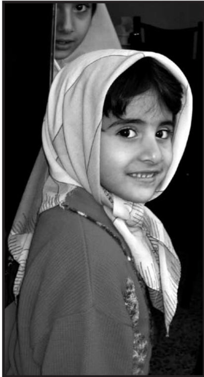
in Iran

In this fifth year of war and occupation in Iraq, the death and casualty tolls continue to rise at an alarming rate. Instead of withdrawing American troops, our “War President” is intent on sending even more troops and extending the tour of duty for those already in Iraq. Four years after Bush’s “mission accomplished” declaration, there seems to be no end in sight.